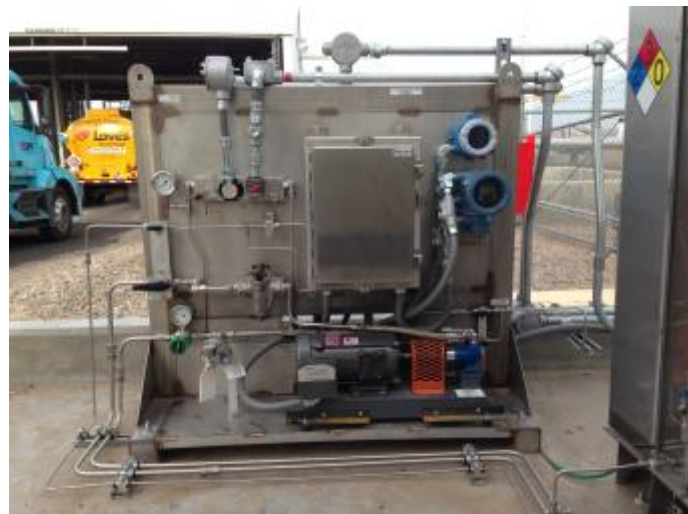
SDA / CI Injection System.