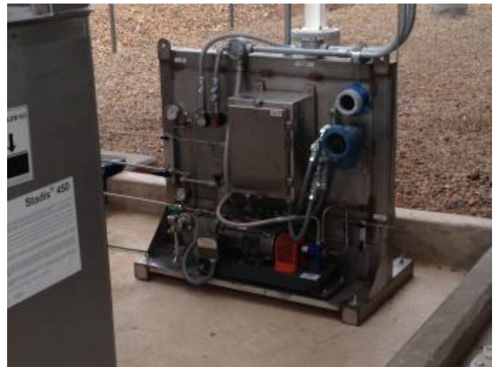
Side view SDA / CI Injection System.

Real Time Additive Injection Solutions the future is meeting JP-8 MTL-DTD-83133 in one well built automated injection system.